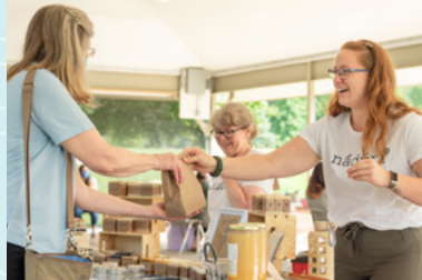
The Minto Makers' Market happens several times each year

LOCALLY LOYAL Minto didn't invent the idea of supporting local small businesses – but it's one of the unspoken and most fiercely demonstrated core values of our community.