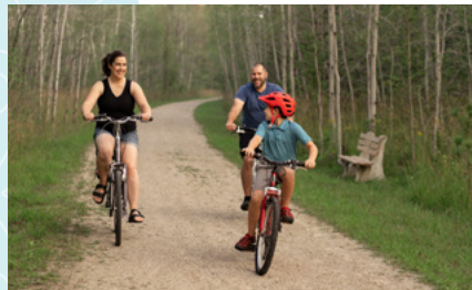
White's Junction Trail, Palmerston

With parks, playgrounds and more than 19km of trails that run through each community, getting outside is easier – and a lot more fun – in Minto.