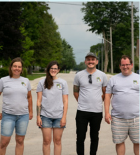
Members of the Minto Pride Committee organize inclusive events for the LGBTQ2S+ community and allies

WHAT SETS MINTO APART? THESE ARE JUST SOME OF THE DIFFERENCES YOU CAN FEEL.