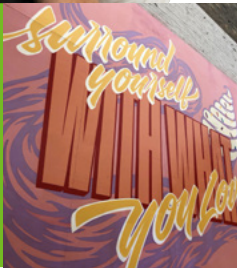
Mural in downtown Harriston